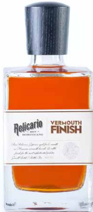
RON RELICARIO VERMOUTH FINISH