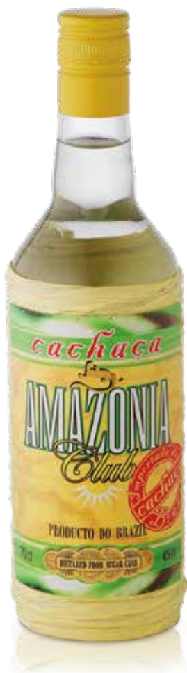
CACHAÇA AMAZONIA CLUB

Made from the juice of the sugarcane, fermented and distilled, Amazonia Club is an exquisite, crystalline cachaça imported from Brazil.