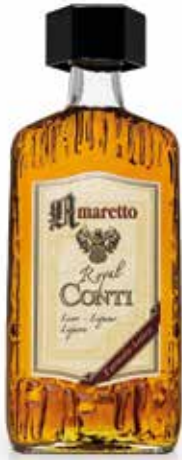
AMARETTO ROYAL CONTI