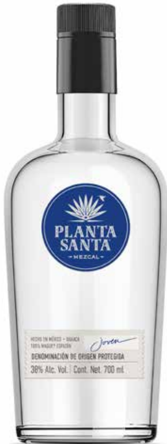
PLANTA SANTA JOVEN

Mezcal is a spirit drink from Mexico with over 400 years of history. Tradition has it that the gods sent down a flash of lightning which went through an agave plant, making the Mezcal sprout. From this legend comes the name of Planta Santa mezcal.