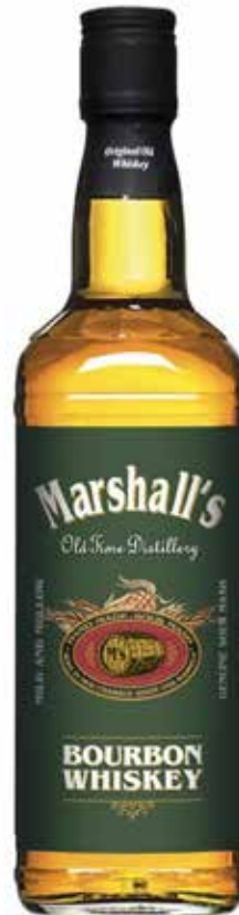
MARSHALL'S BOURBON WHISKY

Marshall's is an authentic bourbon, distilled and aged in new oak barrels in Kentucky. It has red-gold tones and a characteristic touch of sweetness, as well as a fruity aroma.