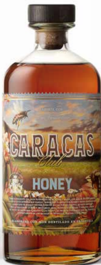
CARACAS CLUB HONEY