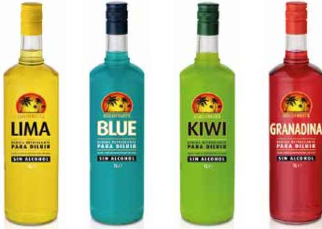
LIMA / BLUE / KIWI / GRANADINA