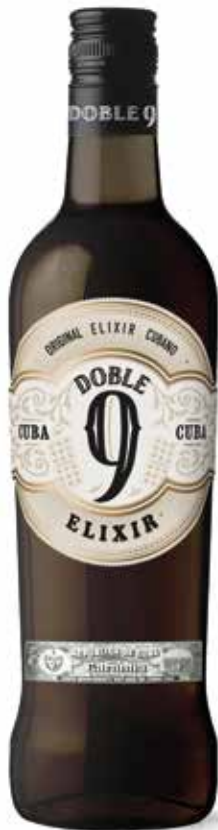
DOBLE 9 ELIXIR