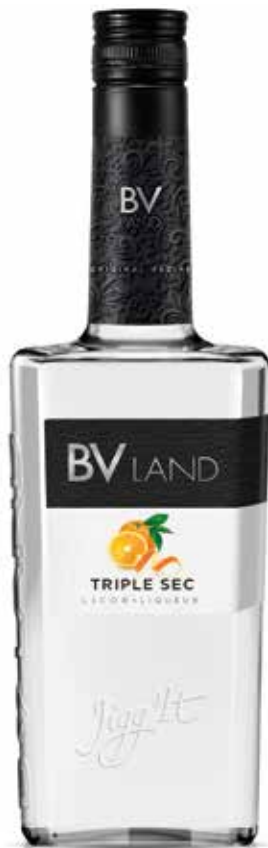
BVLAND TRIPLE SEC

Macerations are made of the previously selected fruit in our traditional stills, ensuring the optimum ripeness in order to obtain lasting and natural aromas, recalling the characteristic aroma of the ripe fruit. Let yourself be inspired by the 32 liqueurs that BVland has designed for you.