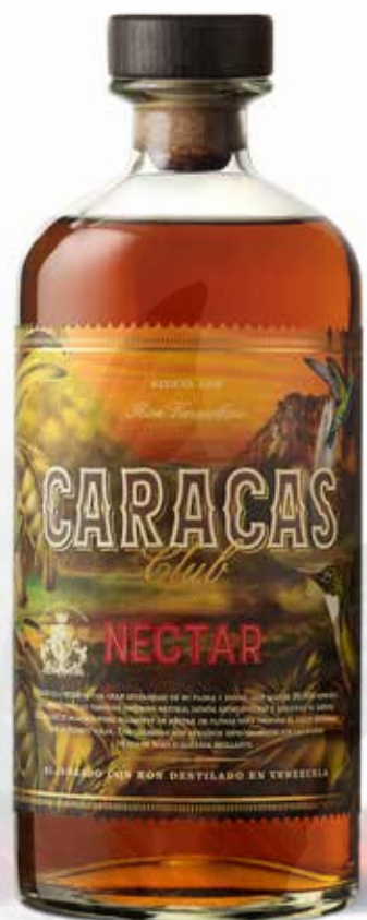
CARACAS CLUB NECTAR