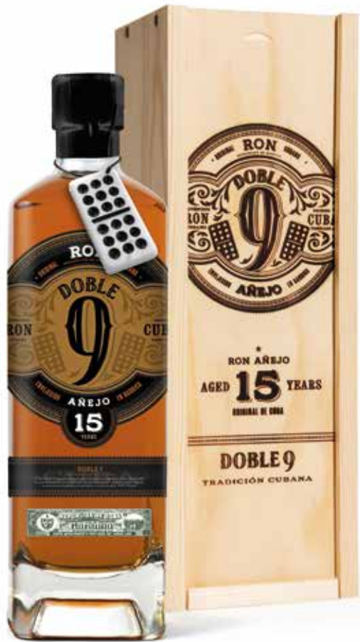
DOBLE 9 - 15 YEARS