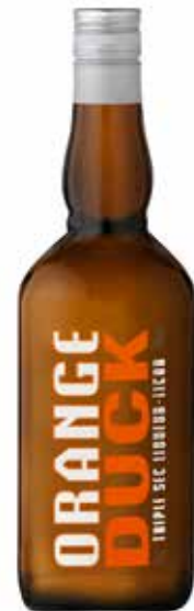
TRIPLE SEC ORANGE DUCK