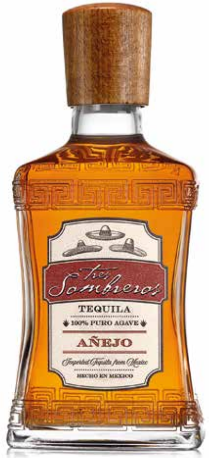
TEQUILA AÑEJO 100% AGAVE