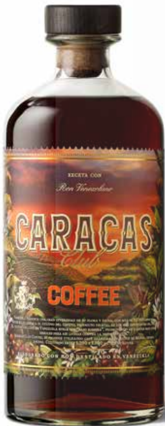
CARACAS CLUB COFFEE

Caracas Club Nectar starts from the base of Caracas Club 8 Years, with a subsequent maceration of cacao and various native fruits such as figs, citrus peel and banana.