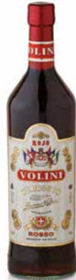
VERMOUTH VOLINI ROSSO