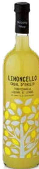
LIMONCELLO CASAL D'EMILIA