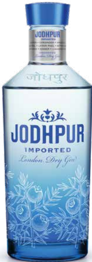
LONDON DRY GIN

Jodhpur London Dry Gin is a four times distilled gin following the traditional London