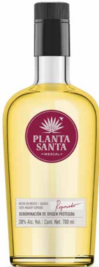
PLANTA SANTA REPOSADO