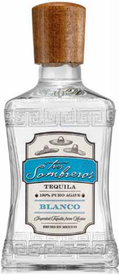
TEQUILA BLANCO 100% AGAVE