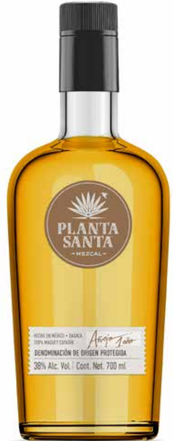
PLANTA SANTA AÑEJO