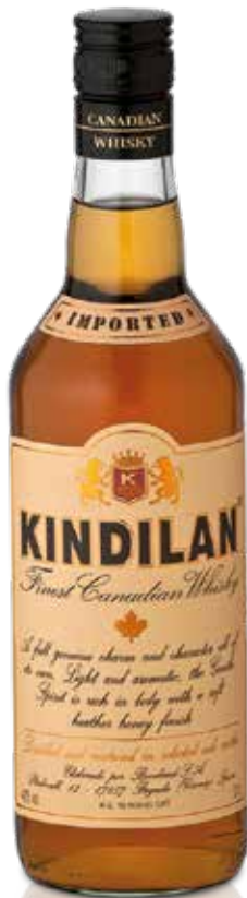
KINDILAN CANADIAN WHISKY

Imported from Canada, Kindilan is a well-known blended whisky, which is mellow and aromatic, full-bodied and smooth.