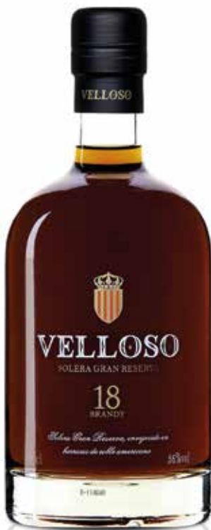
VELLOSO BRANDY 18

Napoleon is the result of distilling carefully selected wines and aging them in oak barrels.