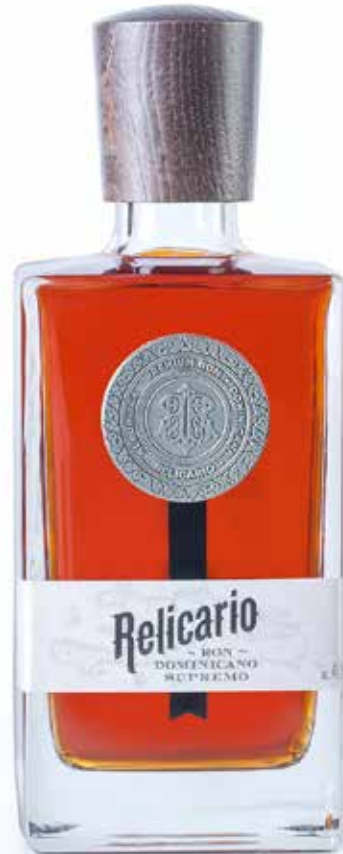
RON RELICARIO SUPREMO