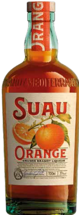
SUAU BRANDY ORANGE