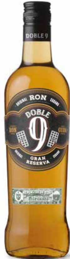
DOBLE 9 AÑEJO RESERVA