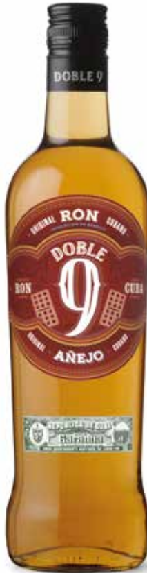
DOBLE 9 AÑEJO