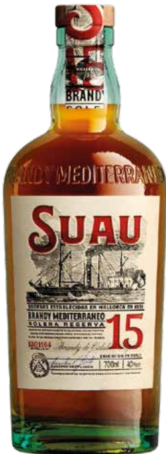
SUAU BRANDY 15

A Brandy of Mallorca, born in 1851, top quality aged exclusively handmade in the microclimate of our underground, cellar of Mallorca, following the “solera” system in the same conditions as over 160 years ago.