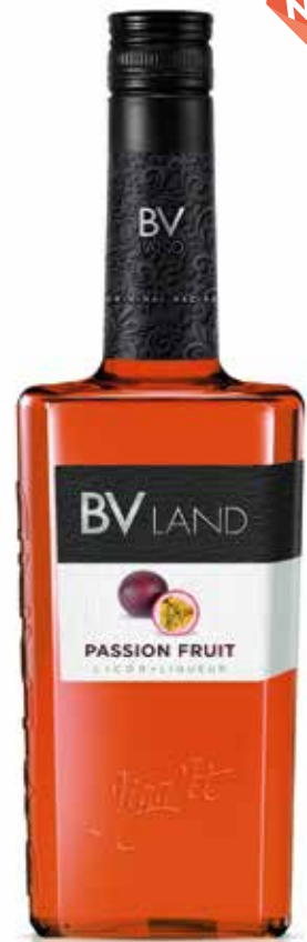
BVLAND PASSION FRUIT