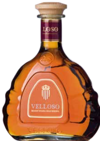
VELLOSO BRANDY 25