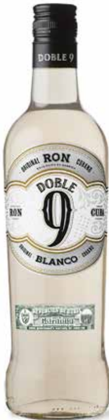
DOBLE 9 BLANCO

Ron Doble 9 a real 100% Cuban rum stands out for having no added sugars and for its wide variety. Resulting in a versatile and high-quality rum.