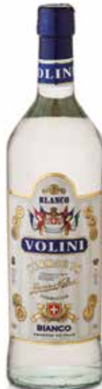
VERMOUTH VOLINI BIANCO