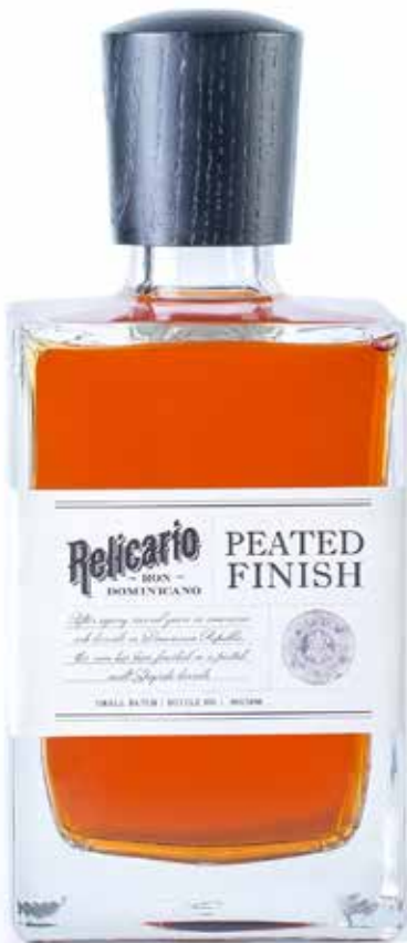
RON RELICARIO PEATED FINISH

Relicario Mancino Vermouth Finish has been developed from Relicario Superior rum, and then aged further 6 months in Mancino Vecchio vermouth barrels from the renowned Piemonte region of Italy.