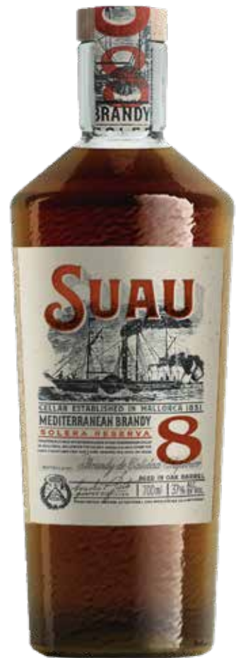
SUAU BRANDY 8