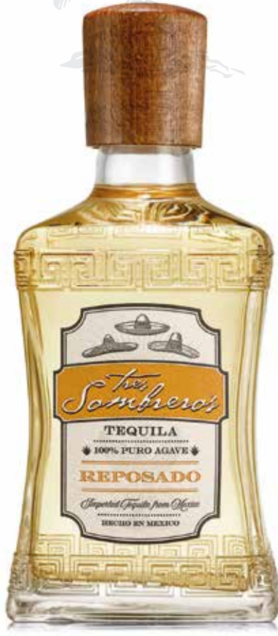
TEQUILA REPOSADO 100% AGAVE